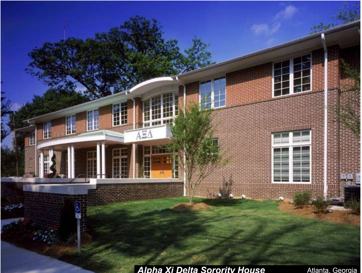
Alpha Xi Delta Sorority House Georgia Institute of Technology